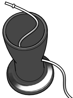
Figure 2: Threading string into cup.

Unroll the entire string from its cardboard spool and thread the free end of the string through the hole in the side of the storage cup. This can be a bit tricky; you may need tweezers to grab the end of the string. Tie another double knot in the end of the string as shown in Figure 2 , then trim the end and pull it tight.